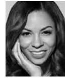
Judge Samarria Dunson