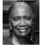
Judge Vanzetta Penn McPherson*