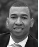
Mayor Steven Reed