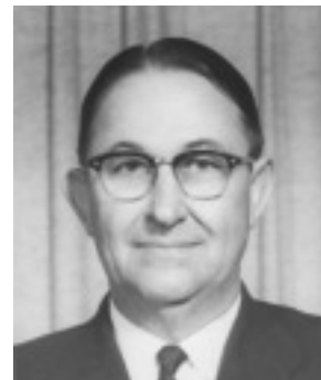
Senator Edward Oswell Eddins, circa 1963.