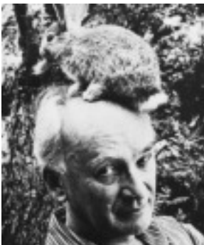
Illustrator and author Garth Williams wearing his inspiration as a hat.

George Wallace: The governor of Alabama from 1963 to 1966. He was elected on the platform "segregation now, segregation tomorrow, segregation forever." He served an additional three terms as governor starting in 1970, and later disavowed his racist past.